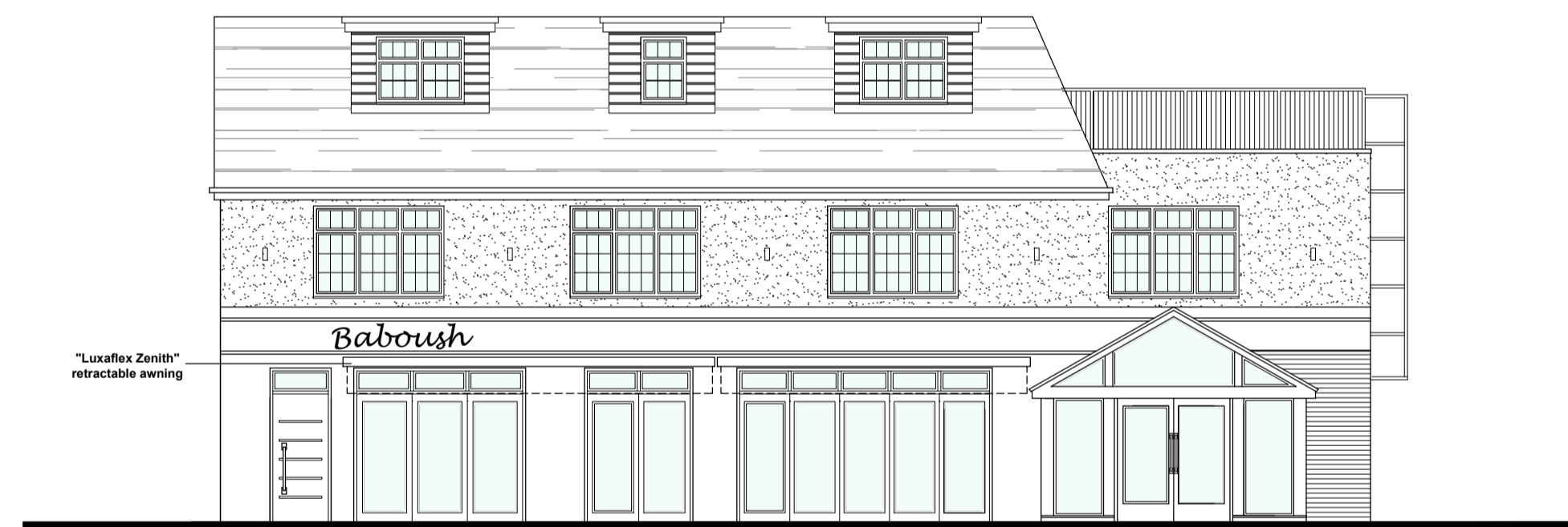
PROP. FRONT ELEVATION SCALE 1:100