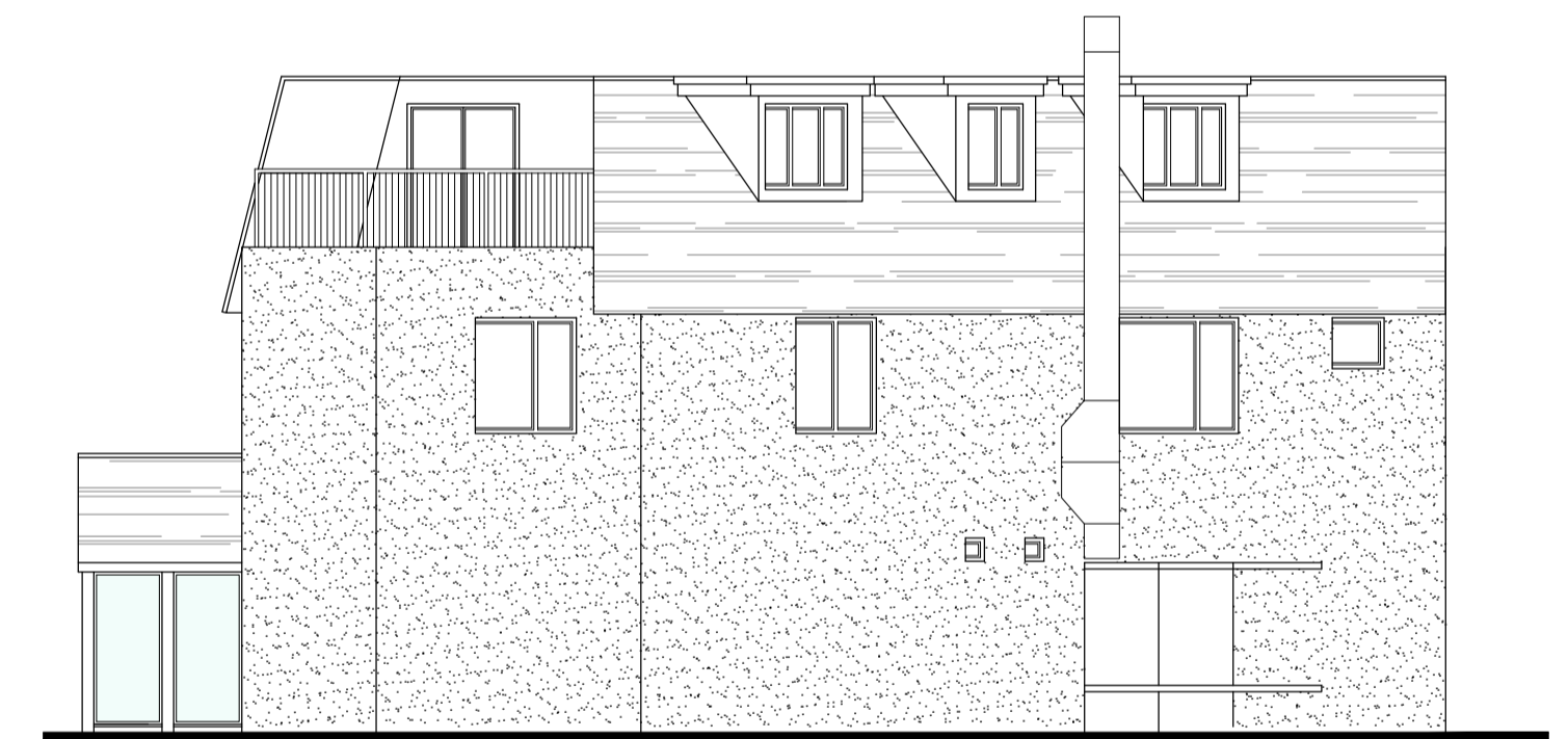
PROP. SIDE ELEVATION SCALE 1:100